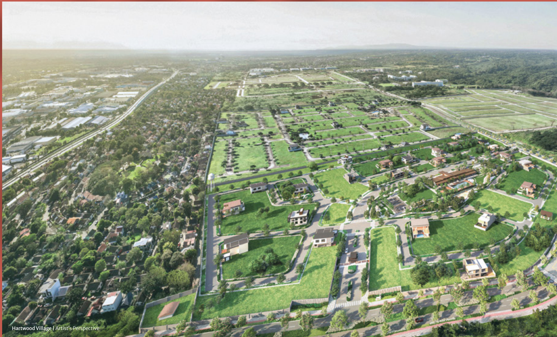
Hartwood Village | Artist's Perspective